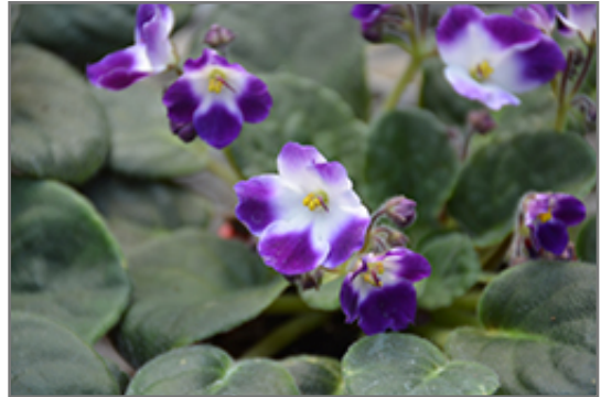
Little Axel African Violet flowers