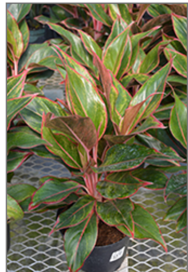
Siam Aurora Chinese Evergreen in full