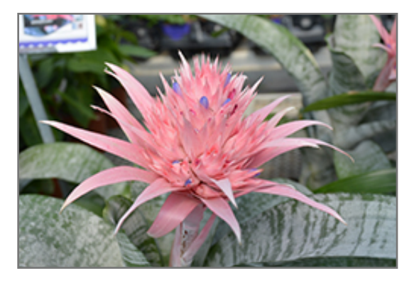
Urn Plant flowers

This is an herbaceous evergreen houseplant with a shapely form and gracefully arching foliage. Its relatively coarse texture stands it apart from other indoor plants with finer foliage. This plant should never be pruned unless absolutely necessary, as it tends not to take pruning well.