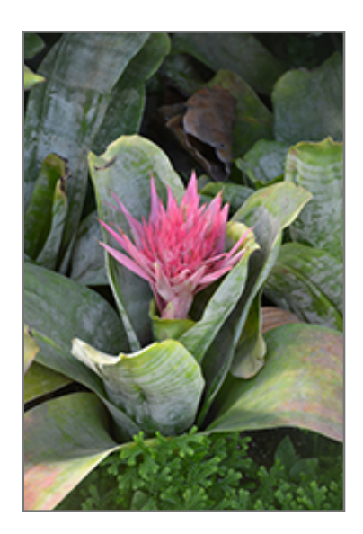
Urn Plant in bloom

8424 Farley St. Overland Park, KS 66212 913.642.6503