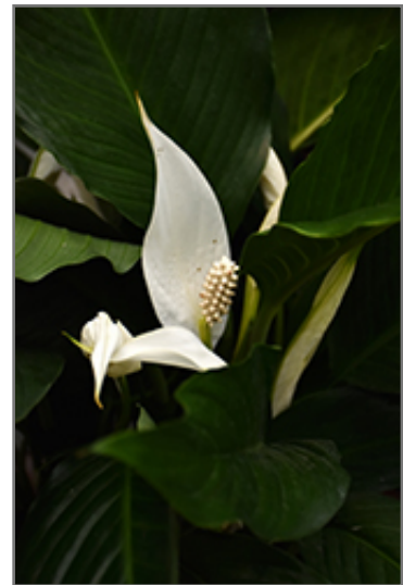
Peace Lily flowers

8424 Farley St. Overland Park, KS 66212 913.642.6503