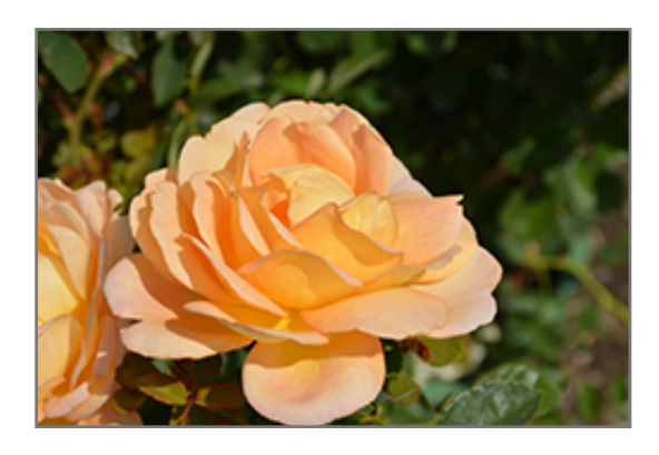
Lady Of Shalott Rose flowers