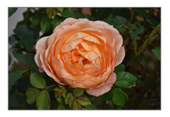
Lady Of Shalott Rose flowers

830 W Liberty Dr. Liberty, MO 64068 816.781.0001