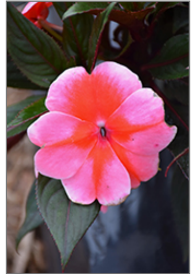
Florific Sweet Orange New Guinea Impatiens flowers

Florific Sweet Orange New Guinea Impatiens is recommended for the following landscape applications;