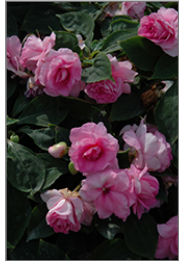
Fiesta Bonita Pink Double Impatiens flowers