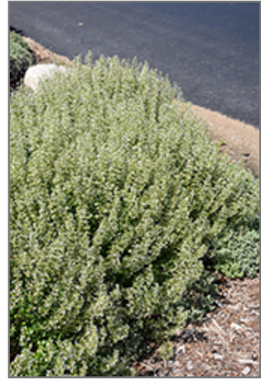
White Cloud Dwarf Calamint in bloom