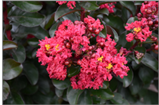
Cherry Mocha Crapemyrtle flowers

Cherry Mocha Crapemyrtle is recommended for the following landscape applications;