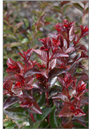
Cherry Mocha Crapemyrtle foliage

Cherry Mocha Crapemyrtle makes a fine choice for the outdoor landscape, but it is also well-suited for use in outdoor pots and containers. With its upright habit of growth, it is best suited for use as a 'thriller' in the 'spiller-thriller-filler' container combination; plant it near the center of the pot, surrounded by smaller plants and those that spill over the edges. It is even sizeable enough that it can be grown alone in a suitable container. Note that when grown in a container, it may not perform exactly as indicated on the tag - this is to be expected. Also note that when growing plants in outdoor containers and baskets, they may require more frequent waterings than they would in the yard or garden.