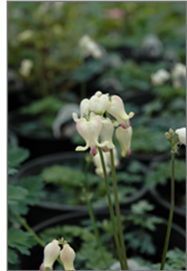
Love Hearts Bleeding Heart flowers

Lacy blue-green foliage on a compact mound; delicate, dangling heart-shaped white flowers with a pale pink blush, and purple-pink tips, on gracefully arching stems, like little jewels in the garden; likes moist, shady areas