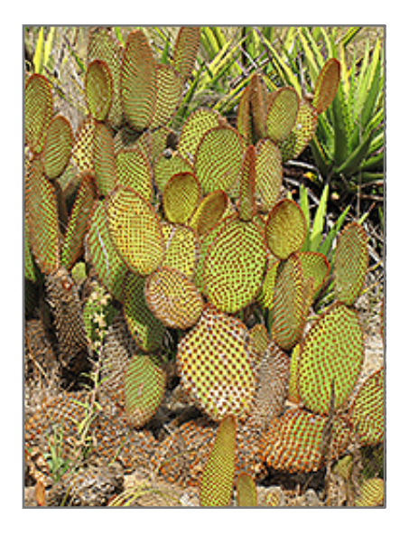
Cinnamon Cactus

830 W Liberty Dr. Liberty, MO 64068 816.781.0001