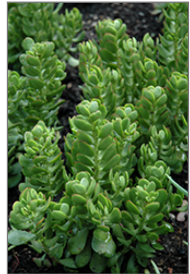
Red Carpet Stonecrop