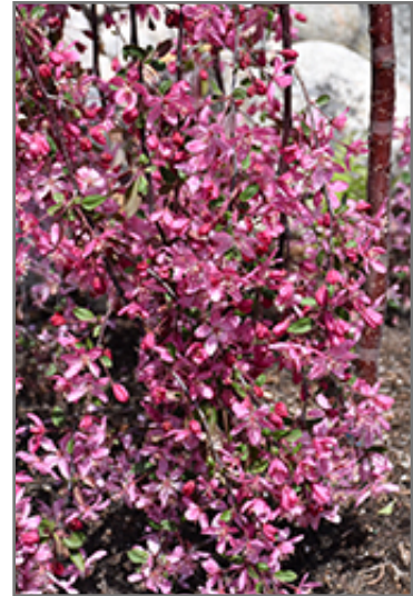
Royal Beauty Flowering Crab flowers