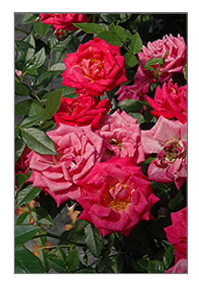
Be My Baby Rose flowers

830 W Liberty Dr. Liberty, MO 64068 816.781.0001