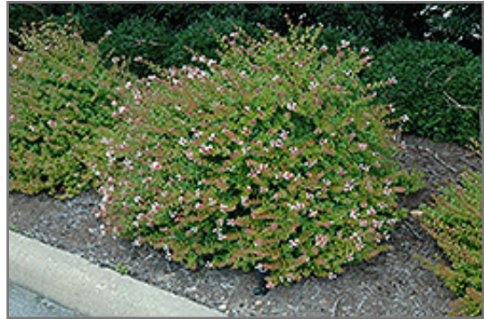
Rose Creek Abelia in bloom

Rose Creek Abelia is recommended for the following landscape applications;