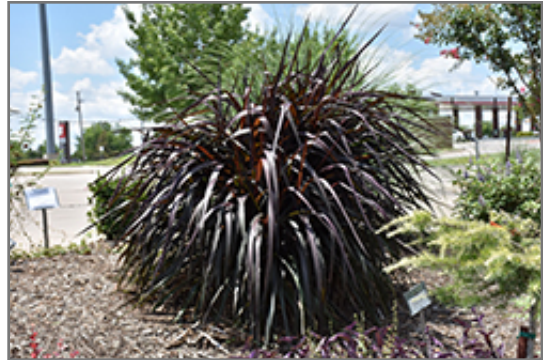
Princess Caroline Fountain Grass

Princess Caroline Fountain Grass is recommended for the following landscape applications;