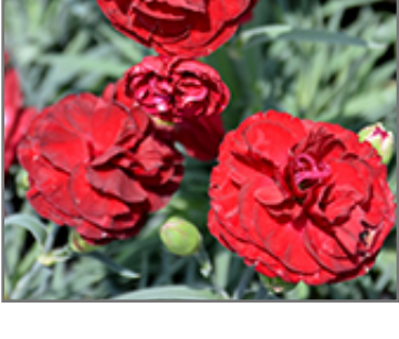
Scent First Passion Pinks flowers

Warm, passionate red double blooms with frilly margins; has an abundance of fragrance that will attract butterflies; deadhead to encourage reblooming; pair up with summer blooming perennials and annuals to time a continued flower display