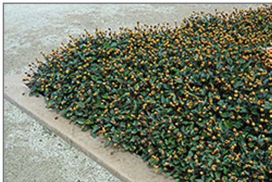
Peek A Boo Para Cress in bloom