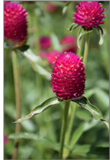
Qis Carmine Gomphrena flowers

Qis Carmine Gomphrena is recommended for the following landscape applications;