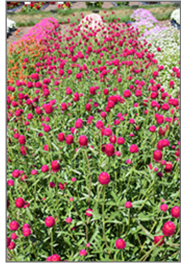
Qis Carmine Gomphrena in bloom

Qis Carmine Gomphrena is a fine choice for the garden, but it is also a good selection for planting in outdoor pots and containers. With its upright habit of growth, it is best suited for use as a 'thriller' in the 'spiller-thriller-filler' container combination; plant it near the center of the pot, surrounded by smaller plants and those that spill over the edges. Note that when growing plants in outdoor containers and baskets, they may require more frequent waterings than they would in the yard or garden.