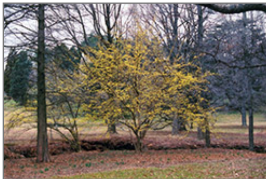
Japanese Cornelian Dogwood in bloom