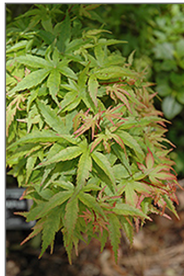
Sharp's Pygmy Japanese Maple foliage