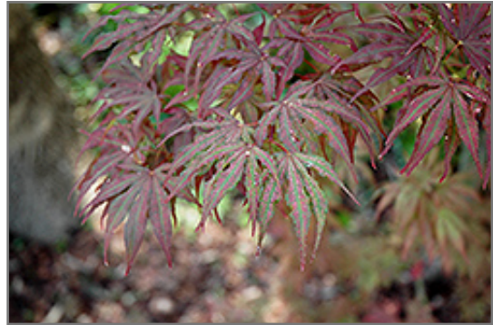
Mikazuki Japanese Maple foliage