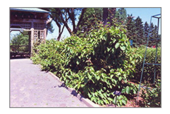
Issai Hardy Kiwi

8424 Farley St. Overland Park, KS 66212 913.642.6503