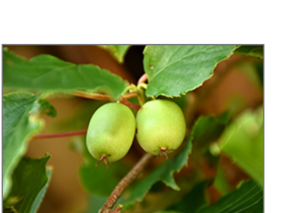
Issai Hardy Kiwi fruit

Aside from its primary use as an edible, Issai Hardy Kiwi is sutiable for the following landscape applications;