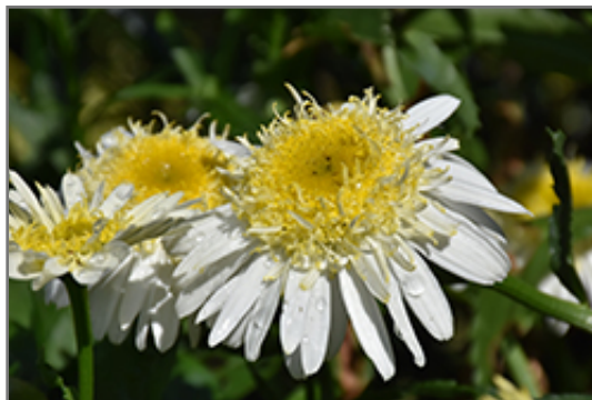
Realflor Real Glory Shasta Daisy flowers

Realflor Real Glory Shasta Daisy is recommended for the following landscape applications;