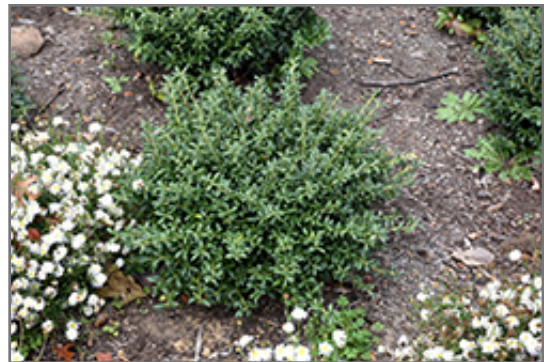
Soft Touch Japanese Holly