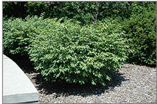
Fire Ball Burning Bush