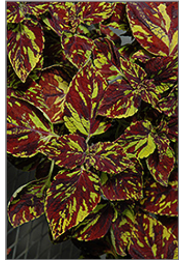
Splish Splash Coleus foliage

Splish Splash Coleus will grow to be about 30 inches tall at maturity, with a spread of 24 inches. When grown in masses or used as a bedding plant, individual plants should be spaced approximately 20 inches apart. Although it's not a true annual, this fast-growing plant can be expected to behave as an annual in our climate if left outdoors over the winter, usually needing replacement the following year. As such, gardeners should take into consideration that it will perform differently than it would in its native habitat.