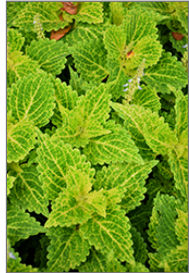
River Walk Coleus foliage

River Walk Coleus' attractive serrated pointy leaves remain dark green in color with distinctive chartreuse veins throughout the year on a plant with an upright spreading habit of growth.