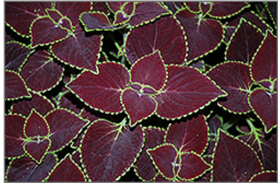
Broadway Coleus foliage