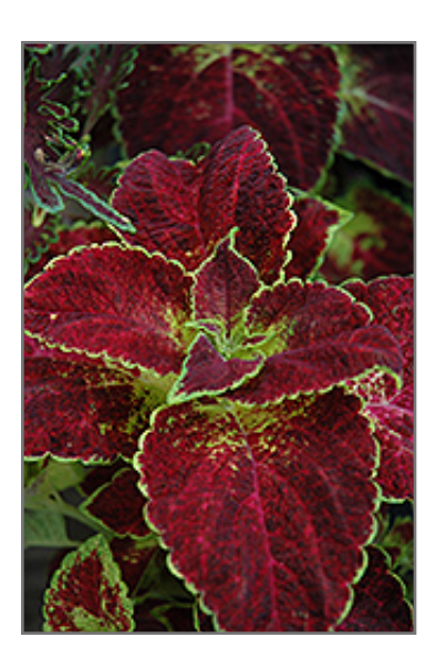
ColorBlaze Dipt in Wine Coleus foliage