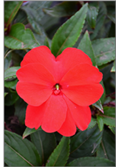
Florific Red New Guinea Impatiens flowers

Florific Red New Guinea Impatiens is recommended for the following landscape applications;