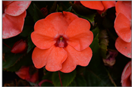
SunPatiens Compact Hot Coral New Guinea Impatiens flowers

This plant will require occasional maintenance and upkeep, and should not require much pruning, except when necessary, such as to remove dieback. It is a good choice for attracting bees and butterflies to your yard. It has no significant negative characteristics.