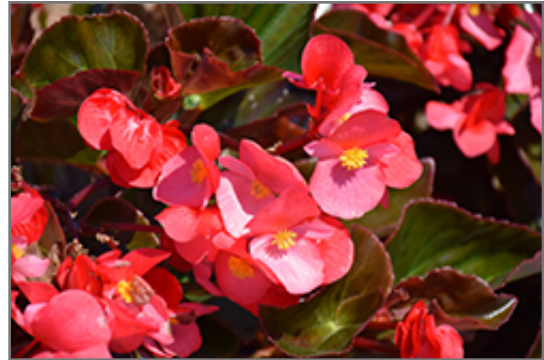
Whopper Rose Bronze Leaf Begonia flowers