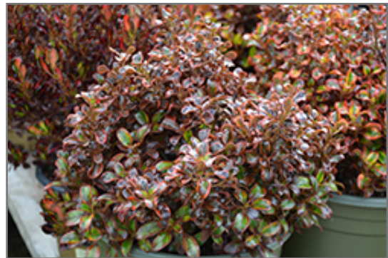
Tequila Sunrise Mirror Bush