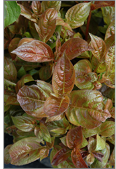
Wings Of Fire Weigela foliage

This shrub should only be grown in full sunlight. It prefers to grow in average to moist conditions, and shouldn't be allowed to dry out. It is not particular as to soil type or pH. It is highly tolerant of urban pollution and will even thrive in inner city environments. This is a selected variety of a species not originally from North America.