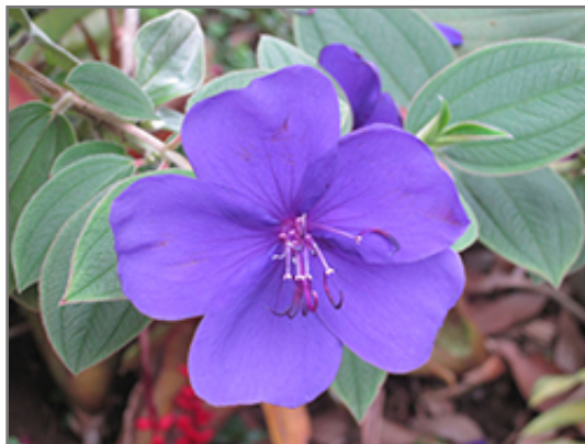
Princess Flower flowers

Princess Flower is recommended for the following landscape applications;