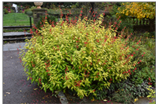
Golden Delicious Pineapple Sage in bloom