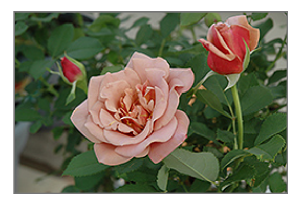
Koko Loko Rose flowers

8424 Farley St. Overland Park, KS 66212 913.642.6503