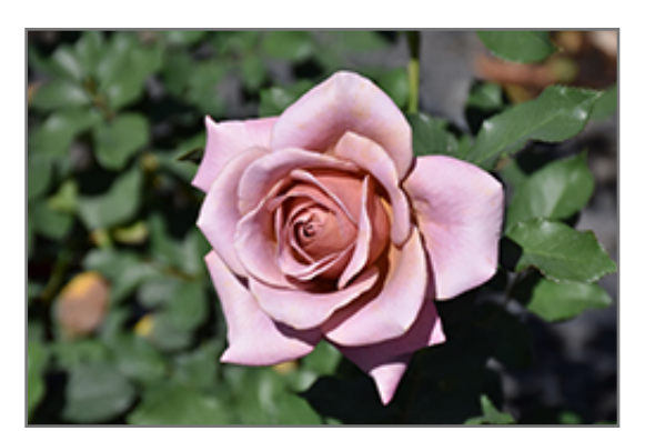
Koko Loko Rose flowers