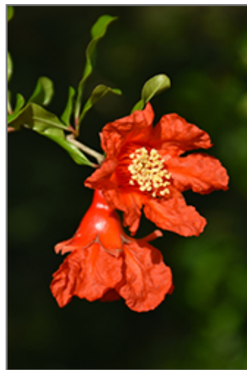
Pomegranate flowers