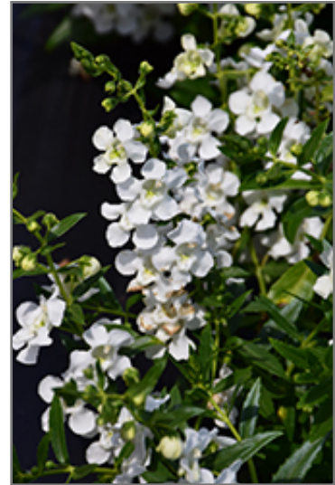
AngelMist Spreading White Angelonia flowers

This plant will require occasional maintenance and upkeep, and should not require much pruning, except when necessary, such as to remove dieback. It is a good choice for attracting butterflies to your yard, but is not particularly attractive to deer who tend to leave it alone in favor of tastier treats. It has no significant negative characteristics.