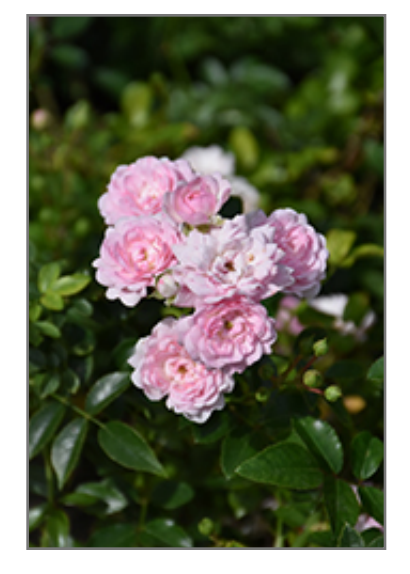
The Fairy Rose flowers

830 W Liberty Dr. Liberty, MO 64068 816.781.0001