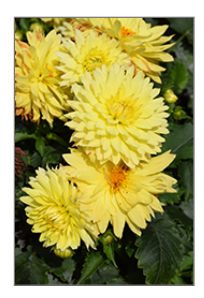
XXL Durango Dahlia flowers

8424 Farley St. Overland Park, KS 66212 913.642.6503