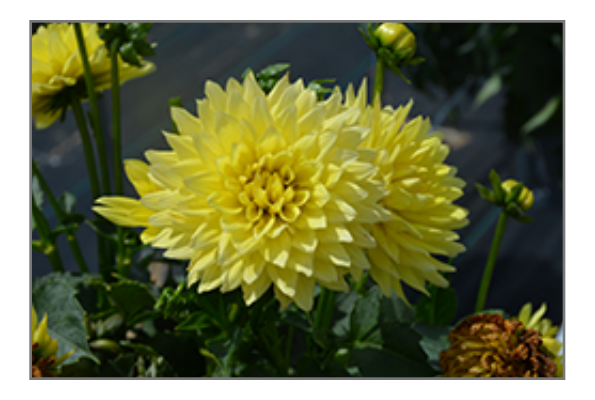
XXL Durango Dahlia flowers

XXL Durango Dahlia is recommended for the following landscape applications;