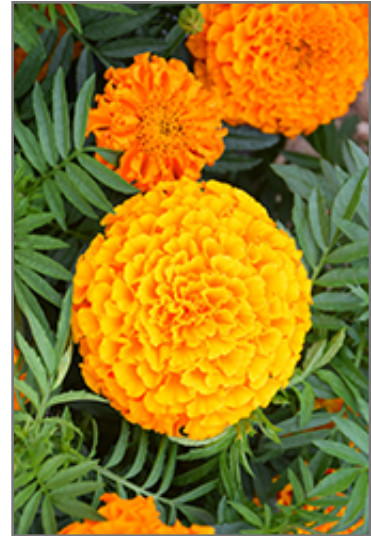
Taishan Orange Marigold flowers