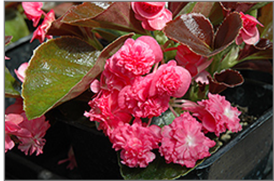
Doublet Rose Begonia flowers