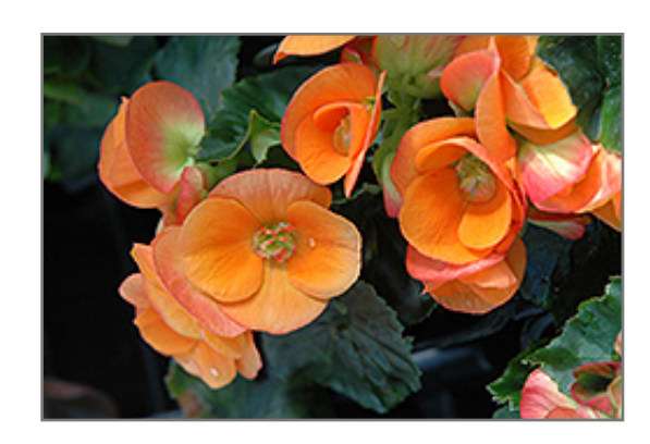
Dark Britt Begonia flowers