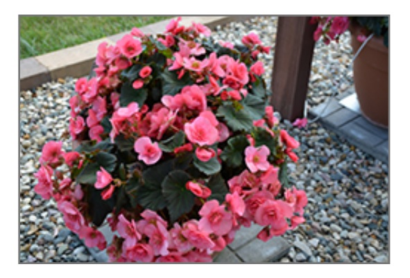
Solenia Light Pink Begonia in bloom

Solenia Light Pink Begonia is a fine choice for the garden, but it is also a good selection for planting in outdoor containers and hanging baskets. It is often used as a 'filler' in the 'spiller-thriller-filler' container combination, providing a mass of flowers against which the thriller plants stand out. Note that when growing plants in outdoor containers and baskets, they may require more frequent waterings than they would in the yard or garden.