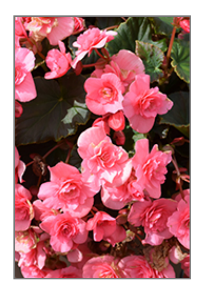
Solenia Light Pink Begonia flowers

8424 Farley St. Overland Park, KS 66212 913.642.6503