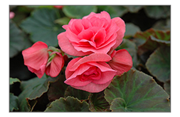
Solenia Light Pink Begonia flowers

This is a high maintenance plant that will require regular care and upkeep, and usually looks its best without pruning, although it will tolerate pruning. Deer don't particularly care for this plant and will usually leave it alone in favor of tastier treats. Gardeners should be aware of the following characteristic(s) that may warrant special consideration;