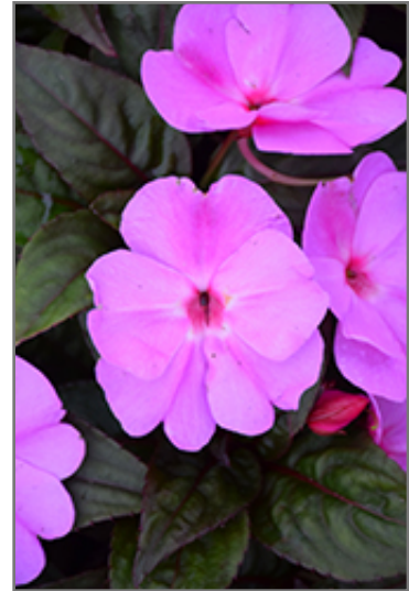
Divine Lavender New Guinea Impatiens flowers

Divine Lavender New Guinea Impatiens is recommended for the following landscape applications;