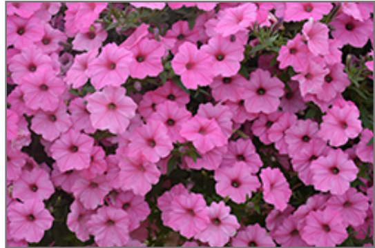
Supertunia Vista Bubblegum Petunia flowers