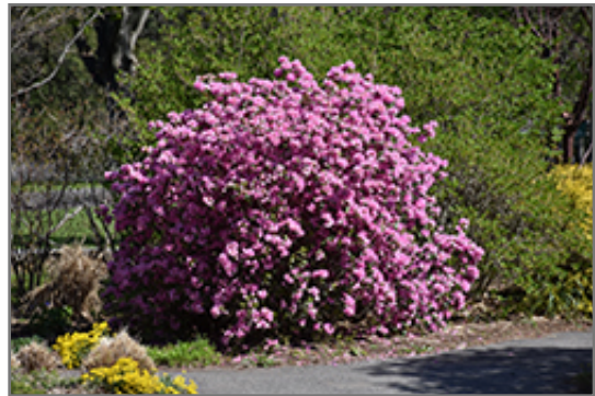
P.J.M. Elite Rhododendron in bloom