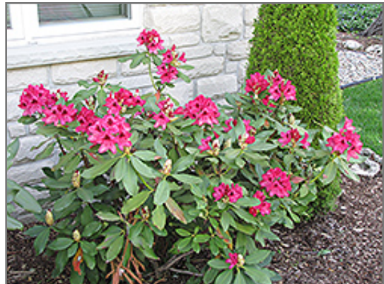
Nova Zembla Rhododendron in bloom